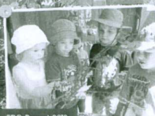
ERO Report 2013:

Respectful and responsive relationships are a defining feature of the Centre practices. Teachers are attentive and provide very good quality individual care and attention in an emotionally supportive and nurturing environment.