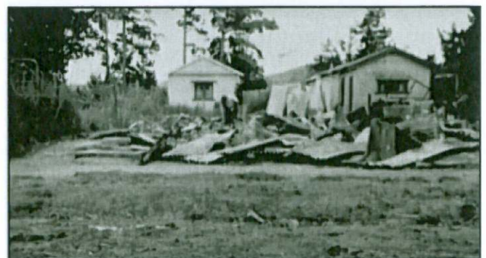
Herald Island Store Fire damage 1951