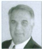
Warren Bexley Residential Sales

PROMPT SERVICE * 1 YEAR GUARANTEE ON WORK CARRIED OUT