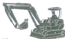
Glen Lupton Owner Operator

PH: 0274 776 154 A/H: 810 9595 ● 65 Bethells Rd Waitakere Auckland